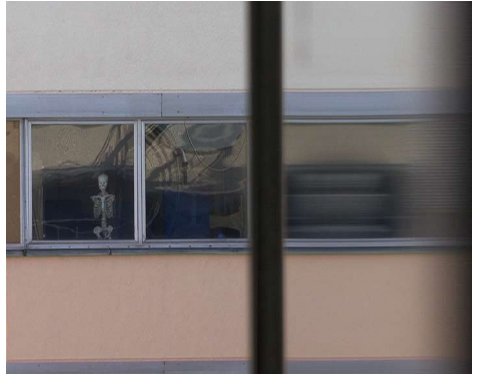
YES / NO _ view 07 Dresden 2008 Stills. Digital Video (DV-Cam) / DVD. Mute 7 min. Loop