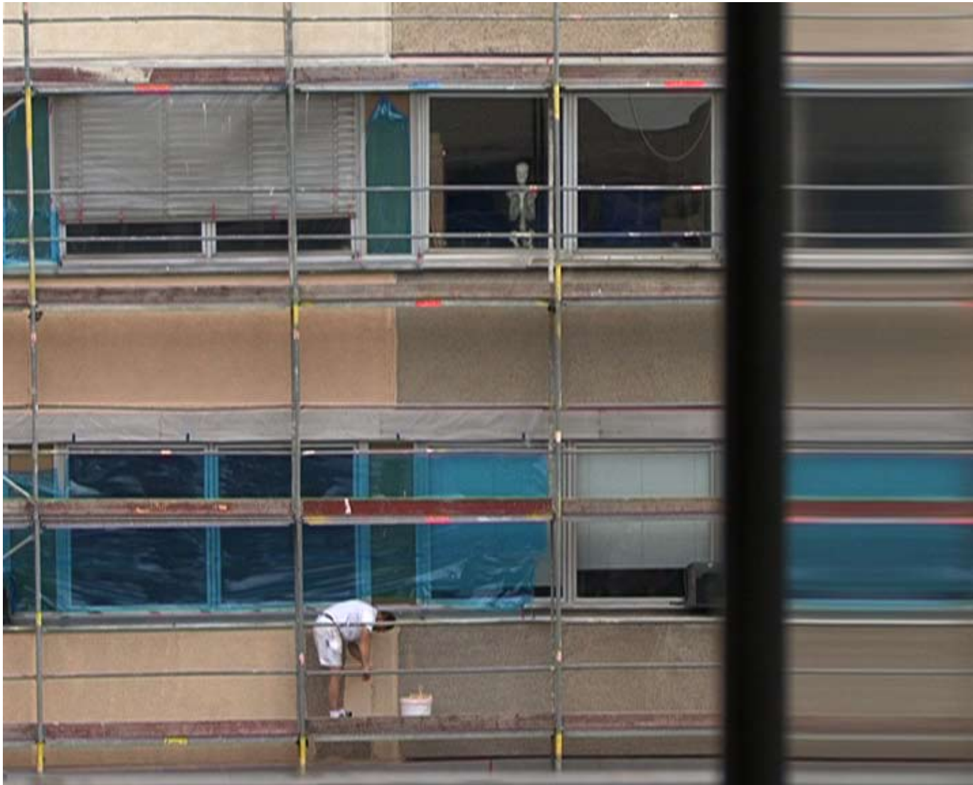
YES / NO _ view 04. Dresden 2008. Stills. Digital Video (DV-Cam) / DVD. Mute. 7 min. Loop