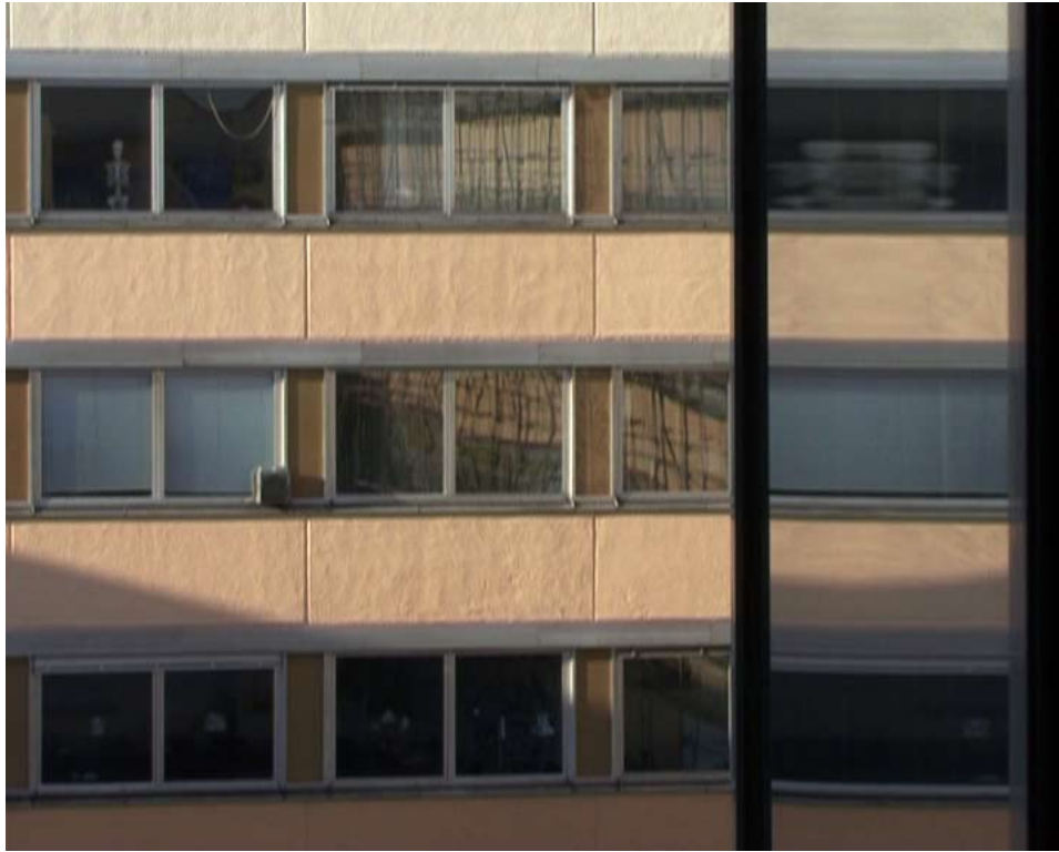
YES / NO _ view 08 Dresden 2008 Stills. Digital Video (DV-Cam) / DVD. Mute 7 min. Loop