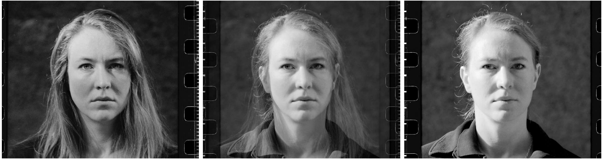
Selbstportrait (Selfportrait). Dresden 2000 Stills. Photography / Digital Video / DVD. Mute. 6 min. Loop